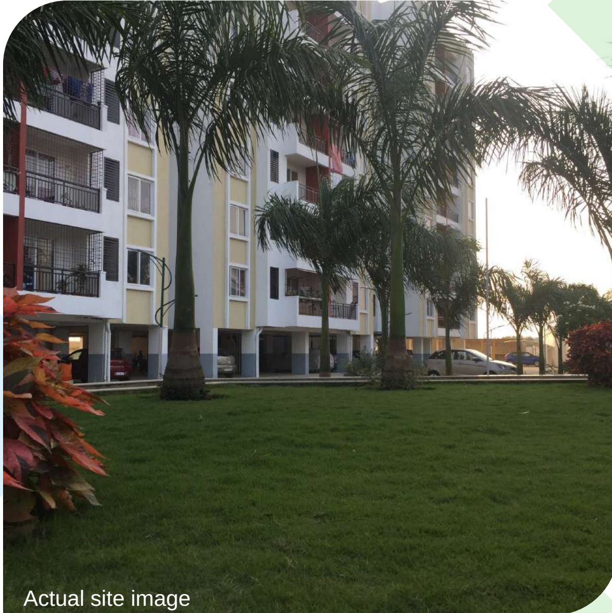
Actual site image

The magnificence and gracefulness of these lavish abodes allure you and make you feel delighted in the cheerful surroundings. Every corner of this resplendent project emanates a sense of style and aura that endows you with a comfortable life in your own cozy arena. Definer Kingdom welcomes you with open arms to become an integral part of this brilliant project and immerse yourself in the beauty of a vivacious lifestyle with luxurious landscape garden and huge open space.