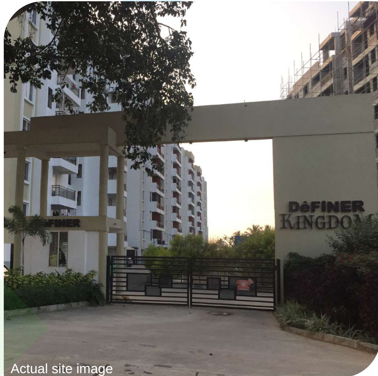
Actual site image

Begin your day with a refreshing gate at the green spaces, feel the breath of fresh air and prepare a hot coffee at your leisure. A living room interact, dining space for the perfect candle light moment, kitchen so inviting to adorn the chef's hat, bedrooms to complement the luxury and the homes satisfy your every need, feeling of freedom and complete satisfaction is right there, waiting for you to discover. Come, walk into your Kingdom.